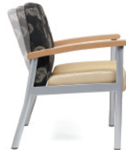
21" Guest chair with Flex-Back shown

Wood armcaps are available in these standard wood finishes: