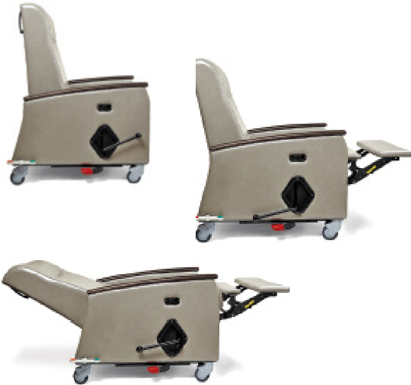
Shown with optional wood arm cap, central locking system and Trendelenburg feature. Cover image also features optional IV pole, side tray and foley bag holder.