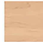
Hard Rock Maple