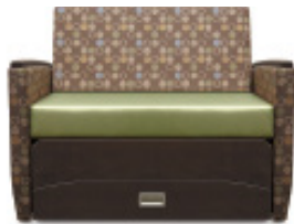
2-person sofa position