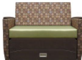
Laminate panel with drawer