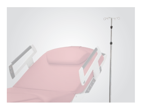
Telescopic infusion stand