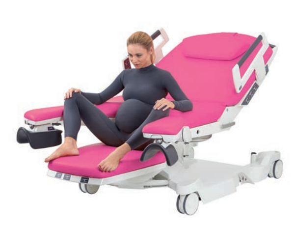
Half sitting using foot section