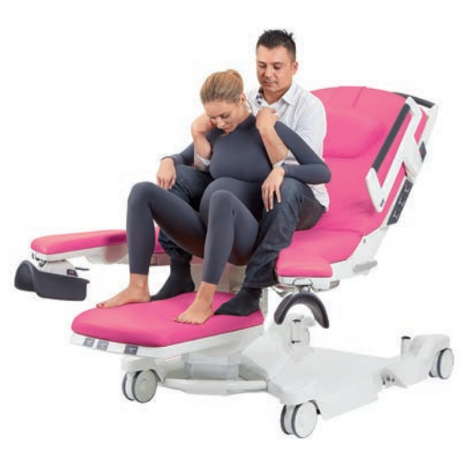
Half sitting with partner assistance