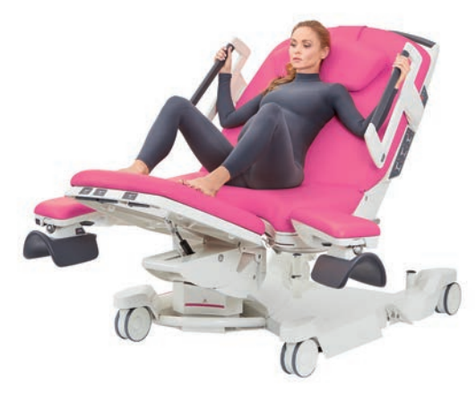
Semirecumbent position with the feet rested on the foot section