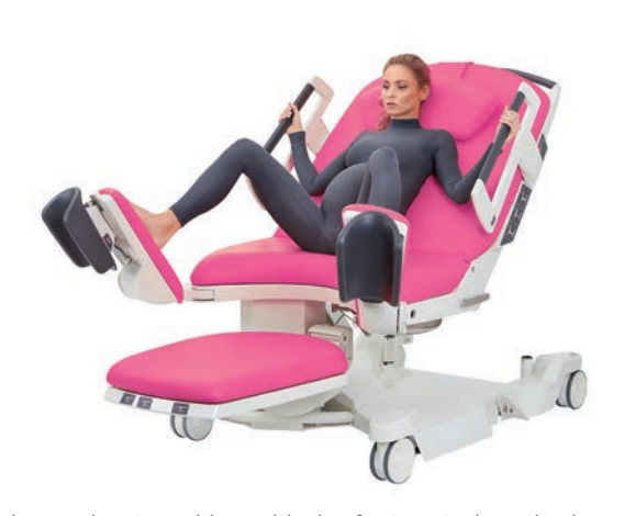
Semirecumbent position with the feet rested on the leg rests