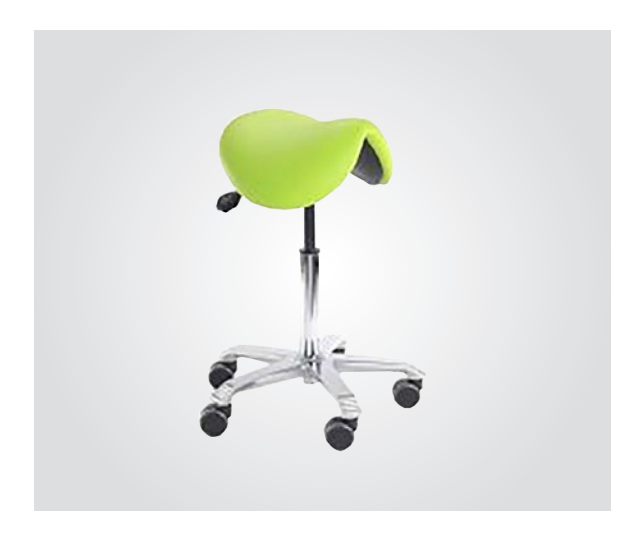
Doctor's chair, ergonomic