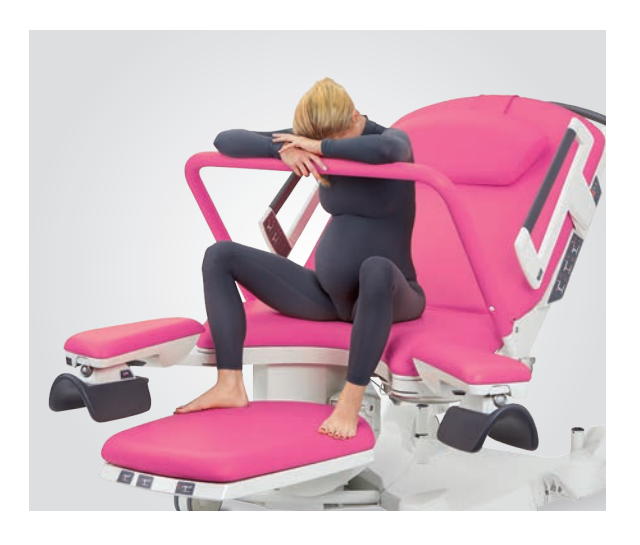
Upholstered support bar