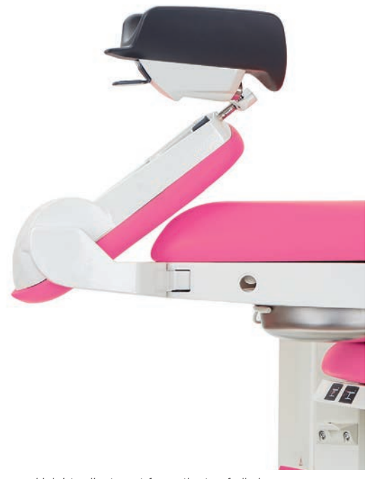
Height adjustment for patients of all sizes.

Quick adjustment of the leg rests into the required position.