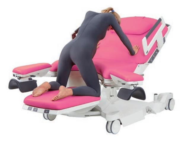
All fours position