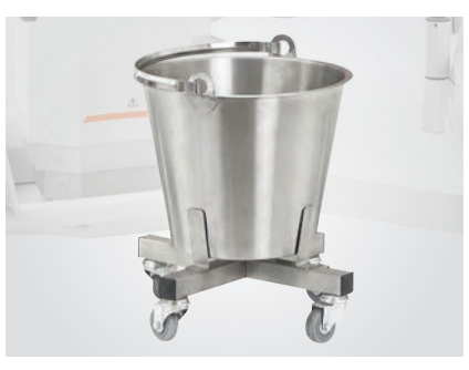
Stainless steel bowl with castors