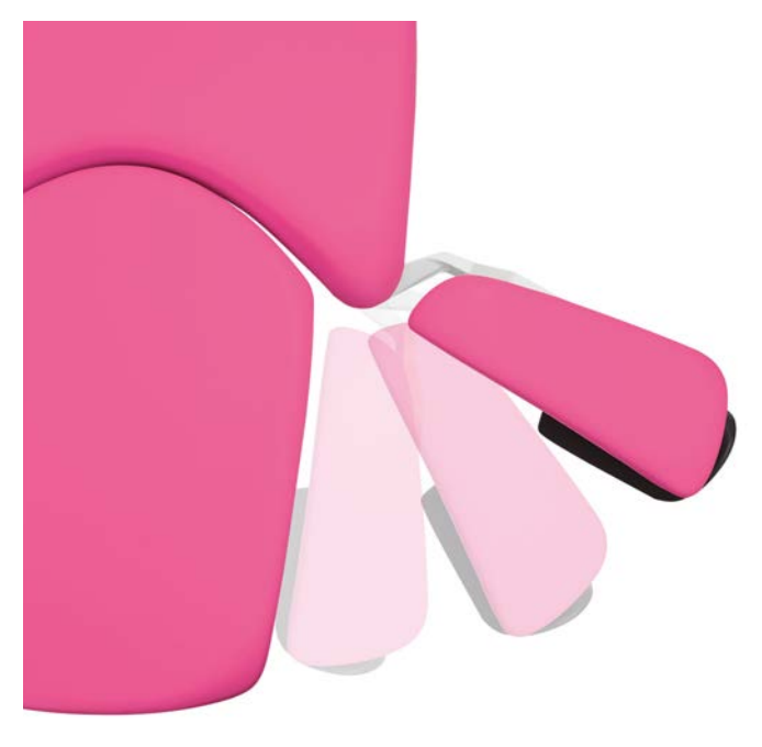
Swing away for improved access.