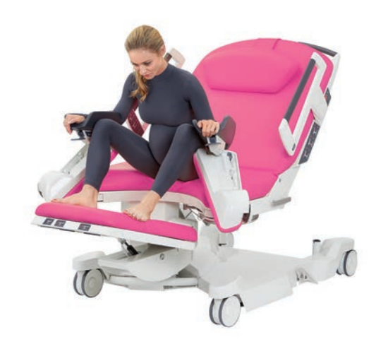
Half sitting using leg holders