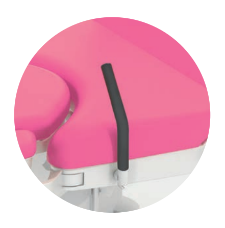
HAND GRIPS Stable and comfortable grips.