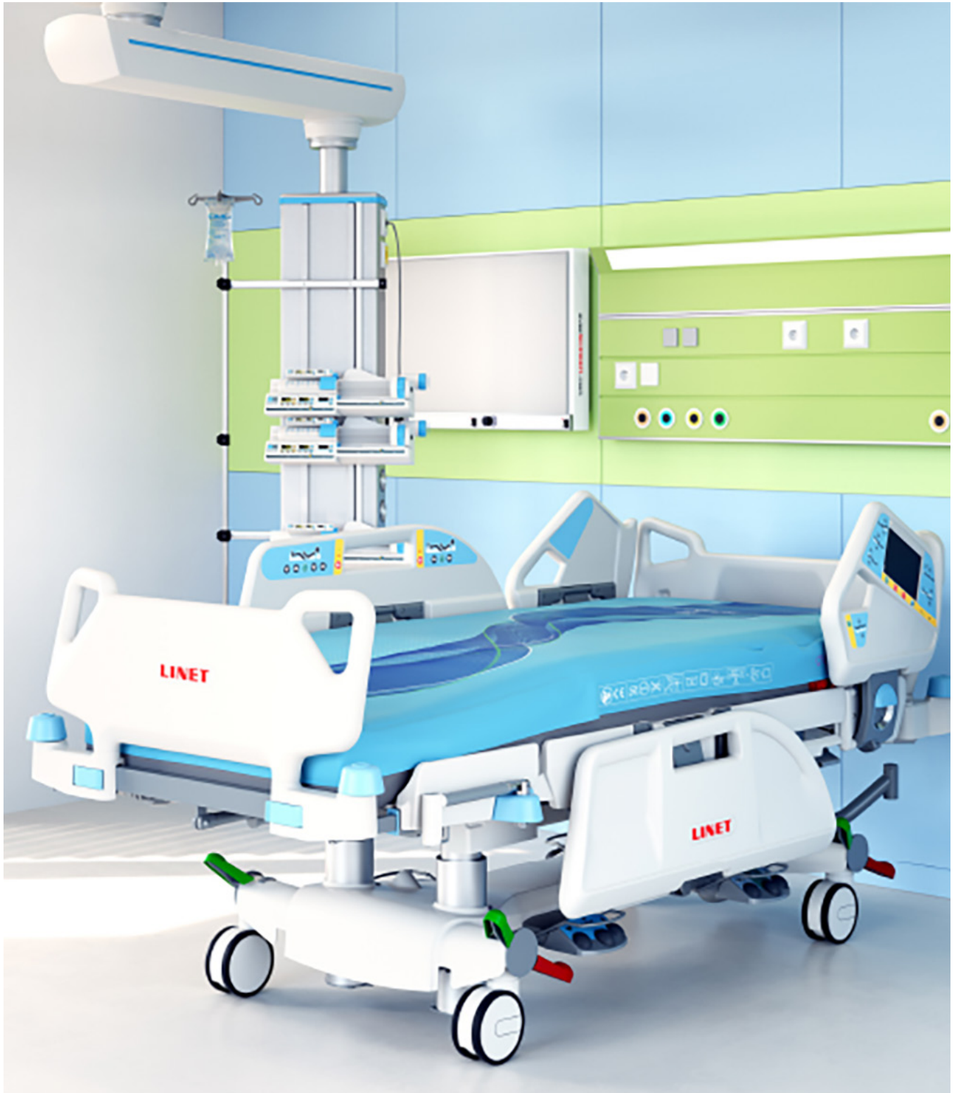
Critical Care Bed