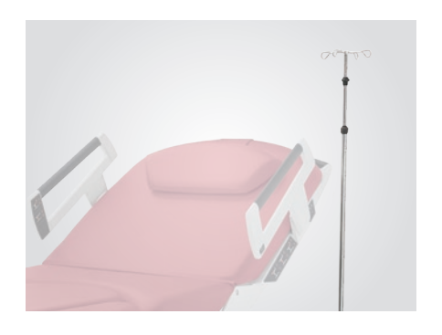
Telescopic infusion stand