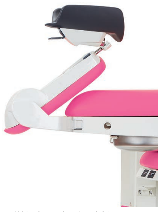
Height adjustment for patients of all sizes.

Quick adjustment of the leg rests into the required position.