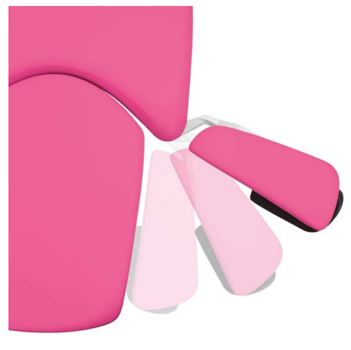
Swing away for improved access.