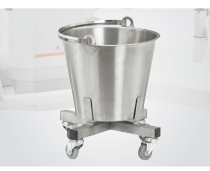
Stainless steel bowl with castors