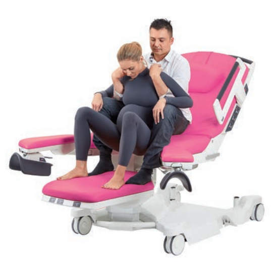
Half sitting with partner assistance