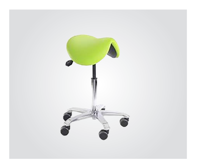
Doctor's chair, ergonomic