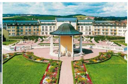
Klinik Bavaria, Kreischa, Germany