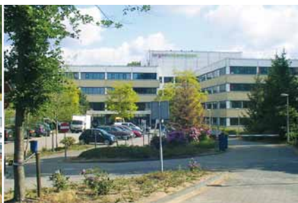
Hospital Tergooi, Blaricum, Netherlands