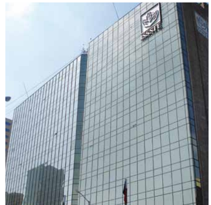
Institute of Social Security and Services for State Workers, Mexico