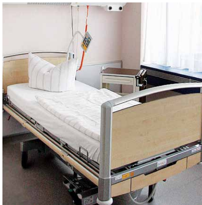
Dorset County NHS Foundation Trust, Great Britain