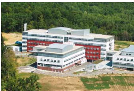
Hospital Doncaster, Great Britain