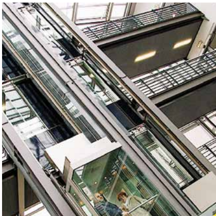
Orbis Medical Park, Netherlands