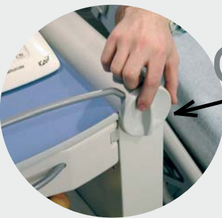
Hand controlled locking