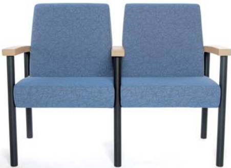
Oasis two seater with full center arm

The Oasis Waiting Room and Lobby Seating Collection is designed exclusively for reception areas and waiting rooms. Clean, contemporary styling paired with ultra-durable construction provides the ultimate healthcare seating solution.