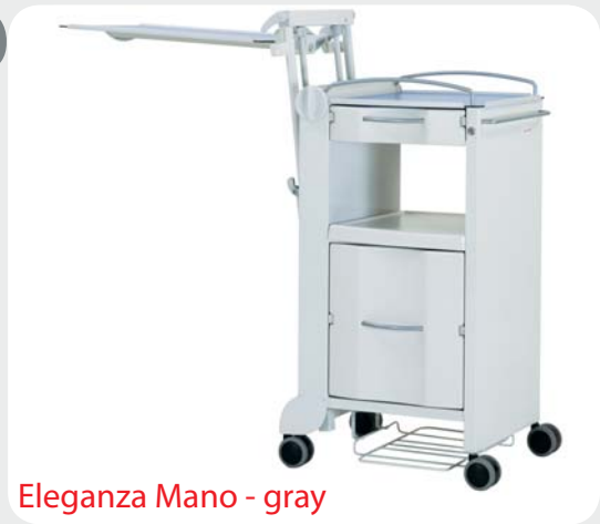
Eleganza Mano - gray

Linet Classic Bedside Cabinets are quite universal and functional for any type of patient.