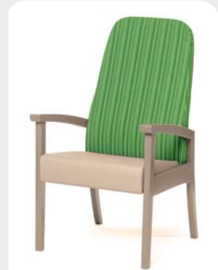
High-back Vista Seating

Durable construction and unique features are standard: