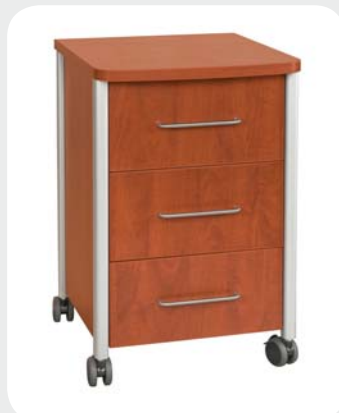
Three Drawer Cabinet