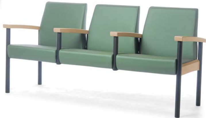
Oasis three seater with center half arms

Oasis offers single chairs, two and three seaters, high-back and bariatric options. Any of these combinations can be grouped together with matching table surfaces to achieve the optimum configuration for any healthcare space.