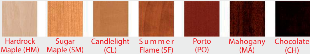
Hardrock Maple (HM)