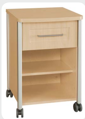
Single Drawer Cabinet