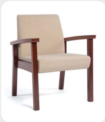
Low-back Oasis Seating

The Vista and Oasis seating collections have been thoughtfully designed and engineered. We offer a wide variety of wood finishes and fabric choices allowing you to create the perfect combination for your health space.