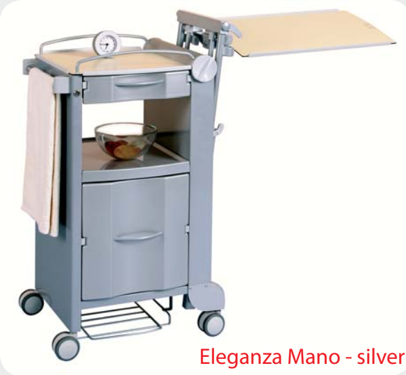
Eleganza Mano - silver

The Linet Mano Bedside Cabinets provide a solution for many patients that have concerns with reduced mobility. The Mano has been recognized for many reasons, including winning the Excellent Design Award. Our features make the patient more self-sufficient and reduces the amount of assistance that a nurse usually provides.