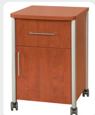
Bedside Cabinet with Door