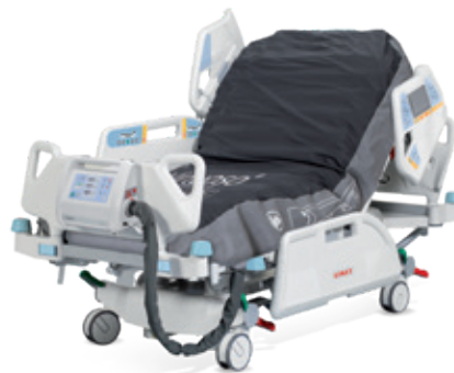
Virtuoso with zero pressure and 3-cell technology.

Multicare open architecture allows using various mattress systems for the prevention or healing of pressure ulcers according to the needs of the patient.