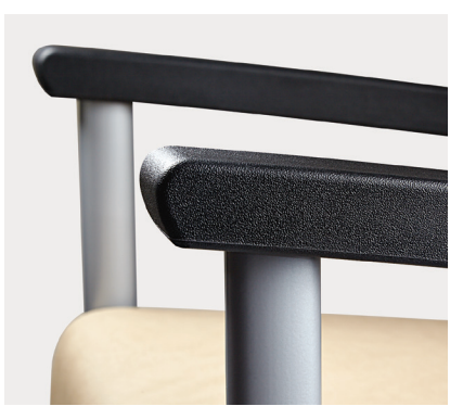
Optional polyurethane arms available in black, grey and taupe