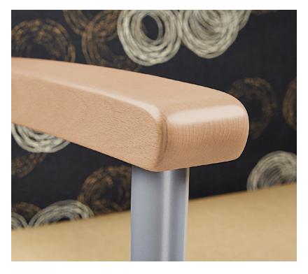
Extended arms feature contoured handgrips for easy ingress and egress