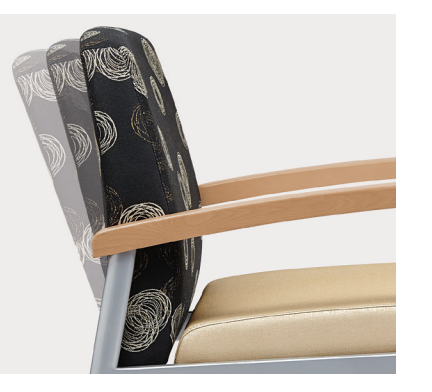
Optional flex-back available on guest and patient chair models