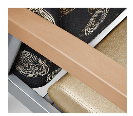
Ample spacing between seat and back enables easier cleaning