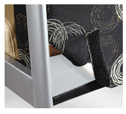
Seat and back upholstery covers are removable for easy cleaning or replacement