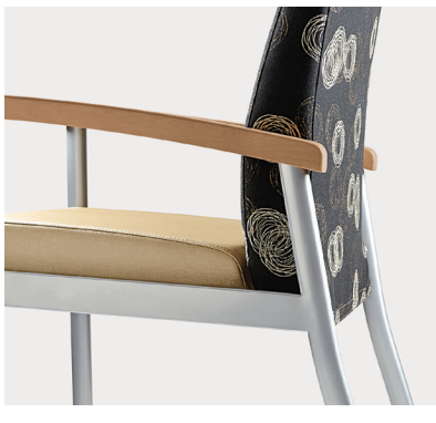
Wall saver rear leg design prevents damage to walls